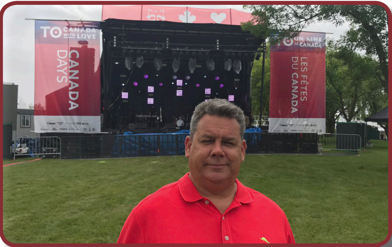
Canada Day Festivities at Humber Bay Park West

On July 1st, South Etobicoke hosted one of several official City of Toronto celebrations in honour of Canada 150. It was a great day filled with music, art, food and community!