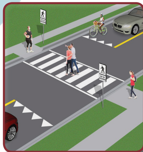
Example of a pedestrian crossing

I know this is an important priority for the community, and it is for me as well.